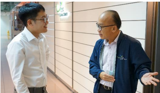
"Right this way, please!"