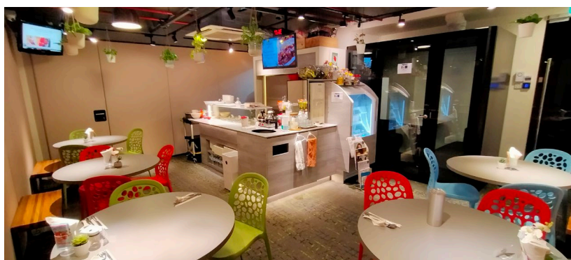
CYS in-house café