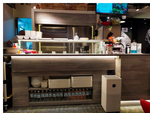
Self serving food counter